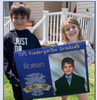
ST. VINCENT DE PAUL SCHOOL WHEELING

Integrated Digital Media classes created Split Personality images, using multiple photographs of themselves and their knowledge of graphic design.